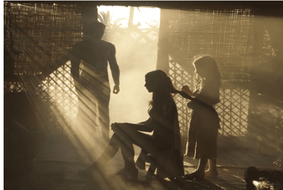
Pict 3. Sersi's hair was braided by a human child Duration 00:28:30-00:28:36

In this scene we see how deep the Eternals' relationship with humans is. In fact, if you pay attention, the Eternals always use very advanced costumes which should make humans at that time panic because of the progress they have not been able to digest. This indicates that Eternal does not need to be another form to worry about because in the movie Eternal is designed to be a guardian and protector figure who is certainly not just an alien. Their mission that binds them to get used to humans makes them fragile creatures like humans so that Eternals are in awe of humans themselves. From this, the Eternals actually want to be more human and heartless so as to form a very unique creature to explore further. And this is in contrast to the Original in that the Eternals have absolutely no intention of being together with humans. They only stand when evils like the Deviants appear in the middle of the balance created.