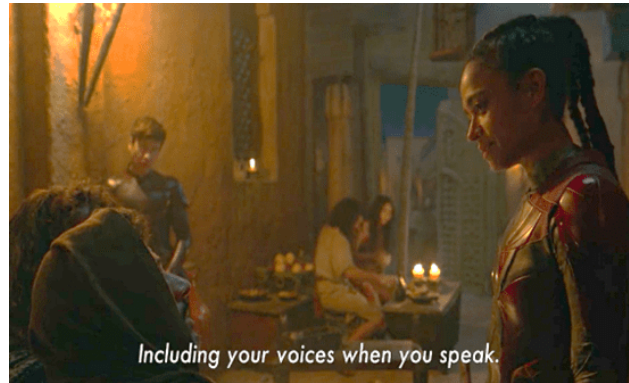
Pict 2. Makkari could feel the vibration Duration 00:26:11-00:26:35

Then, in another scene there is a discrepancy which leads to a point of view that women's voices should be represented by men where women should be able to voice each other. At Scene Makkari is bargaining about the price of expensive artefacts, he communicates using sign language. But it seems that the one who has to voice what Makkari said is Druig who is a male figure. Then it also becomes a question why should men when women can also voice Makkari as Eternals who cannot use the Mouth with their hearing like other normal people.