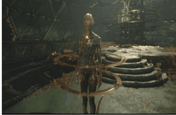
Pict 4. Sersi is being shown the reality of their mission Duration 01:00:08-01:02:05

Through this scene it can be explained that Eternals were created with the aim of replacing Deviants for defects in creation carried out by Celestials through Deviants. Their purpose is clearly indicated to protect man himself but with a specific purpose because humans are explained as intelligent beings who are food from the Celestial seeds in the core of the earth. For thousands of years the Eternals saved other civilizations on other planets with the same goal. Because intelligent beings are food and energy sources and this is part of their mission called awakening. Resurrection is the birth of a new Celestial which of course will destroy the Earth because of the size of the Celestial as a very large cosmic being.