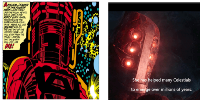
Picture 5. Celestial as a Creator of Universe Duration 00.59.10

The number of Celestials in the comics is much higher and also describes the function of each of them while the movie does not. The movie shows Celestial fleets and only Celestial Arishem often appears in the movie. In the movie Arishem which plays an important role in the introduction of the Celestial itself.