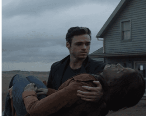
Pict 1. Ajak Is Dead Duration 01:39:42-01:42:02

But if we look at it in more detail. That Ajak character as the leader of the Eternals must die at the beginning of the movie. Her strong character in leadership had to be grounded with his early death. And her death was caused by Ikaris who we know that the character of Ikaris is a male character. This explains that the life of women as leaders must be turned off by the character of a man. So that the existence of Ajak as a leader becomes a question when what is experienced by Ajak in the movie.