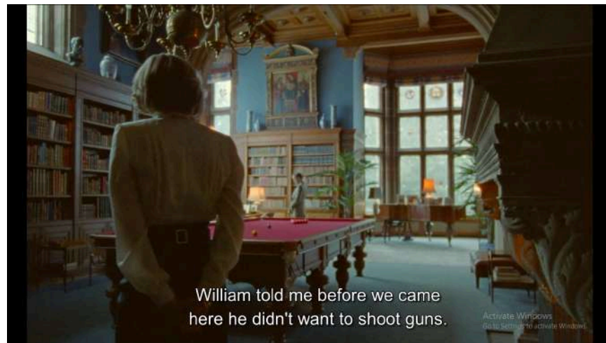
Pict 11. Lady Diana is in debate Duration 52:34

Liberal feminist understanding and movements do not only talk about women's freedom to think, behave and express their thoughts in public spaces. However, in general it provides possibilities and opportunities for women to take part and have the same role as men in household responsibilities such as child custody. So that everything related to children, such as: food, level of education, choice of games and activities in which children will participate, has the right to be known and considered together with the wife. In the scene above, Lady Diana shows emotion towards her husband (Prince William) because he did not listen to her wishes not to involve her child in shooting practice activities. As a mother, of course Lady Diana had her own thoughts and considerations regarding this decision. Regardless of whether the reasons for both parties are correct or not, the point that the researcher wants to emphasize is the involvement of women in joint decision making so that women's aspirations in all walks of life can be heard, acknowledged and accommodated for the sake of realizing overall gender equality.