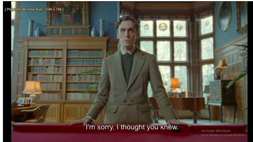
Pict 7. William emphasized Lady Diana to obey royal rules Duration 01:01:35