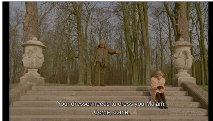
Pict 12 Firmness and regularity emphasized everyone to follow the schedule according to the specified time, including Lady Diana Duration 01:09:42

The series of conversations above shows how strict and inflexible the royal regulations are regarding the time and sequence of events so that every activity outside the royal agenda is also monitored in detail by work officers. While Lady Diana was still enjoying the natural scenery and talking to animals in the yard, she was approached by royal officers to immediately return to the palace to prepare for dinner at 08:00 pm while the time was still 05:00 pm.