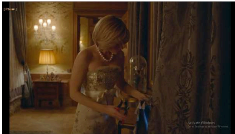
Pict. 2 Lady Diana cut the stitching of the palace curtains Duration 01:16:17

The peak of Lady Diana's resistance to one of the royal traditions that gave her limitations was when she decided to open the seams of the curtains using scissors. Restrictions on rights, including enjoying the natural beauty of the kingdom, can be seen as a form of limiting individual basic rights, as was felt by Lady Diana, so in the end she decided to open them. This is a form of resistance to work traditions. However, what was disturbing was another discovery that when she managed to open the curtains, Lady Diana cut the skin on her own arm. These findings indicate that apart from the desire to free herself, the actions of Lady Diana's character are indicated to have so much mental pressure that it is then released through the act of mentally injuring herself.