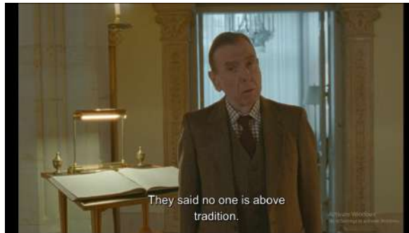
Pict 4. Lady Diana's debate with royal administrators Duration 16:13

The three data above show that there was an argument between Lady Diana and the palace staff whose job it was to weigh her before entering the royal palace to take part in the Christmas celebrations. In this conversation, the royal employee gave confirmation and defense in carrying out his duties by saying that "there is no one above tradition." Indirectly, he wanted to express that everyone is obliged by law to submit and obey royal rules or traditions without exception, including Lady Diana. At this point there was a conflict with Lady Diana's wishes and understanding. So, referring to one of the categories of liberal feminist struggle proposed by Wollstonecraft, women's resistance in opposing established rules in a community and family group because they feel disadvantaged is the entry point seen by researchers because traditions cannot be criticized, contested and tested. repetition is a form of arrogance from tradition itself. Examples of the traditions in question include: weighing yourself before and after Christmas celebrations and expecting your weight to increase after participating in the celebrations at the palace for several days as a form of happiness. Second, they are not allowed to turn on the water heater while bathing. Instead, to overcome the cold after bathing, they will be given thicker and more blankets to combat the feeling of cold. This is something that Lady Diana questioned and opposed.