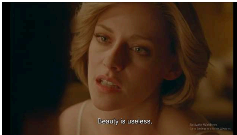
Pict 5. Lady Diana expressed her sadness to one of the royal administrators Duration 28:25-30:33

Page : Remember, we used to talk Diana : They fill your eggs with princes and ride away, that's fine, it's just fine, oh, fuck it. Page : it will be fine Diana : yes it will be fine, you'll be in the world in some pub. Laughing. (looking at the mirror)