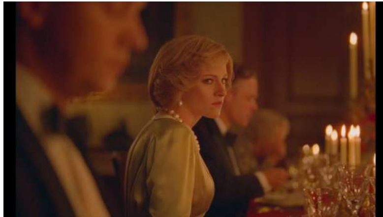
Pict 6. The royal dinner Duration 33:25-34:41

Scene above shows that Lady Diana was attending a royal dinner. At that dinner Lady Diana wore a very beautiful green gown. Apart from that, Lady Diana also wore a pearl necklace given to her by her husband. In this movie, it is depicted that Lady Diana knew about her husband's affair and she also knew that her husband had also given the same pearl necklace to his mistress. This makes Lady Diana feel insulted when she wears the pearls in front of her husband. When she wears the pearl necklace, she feels like she is shackled in a bondage.