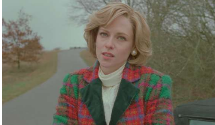
Pict 8. Lady Diana drives alone while visiting the palace Duration 11:14-11:26