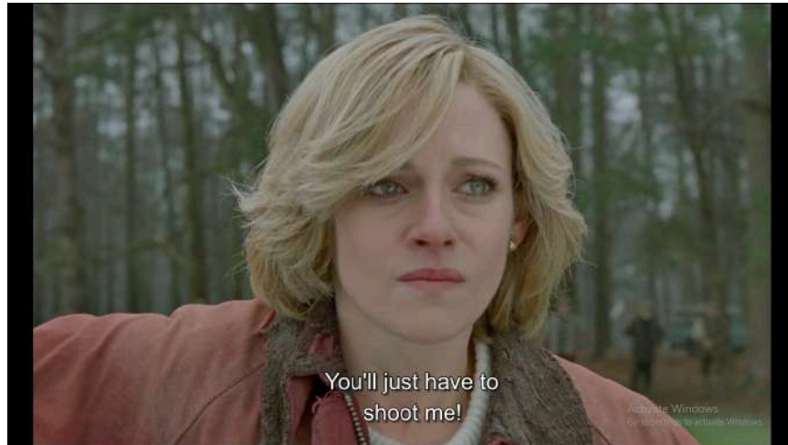
Pict 13 One of the peaks of Lady Diana's resistance Duration 01:44:17