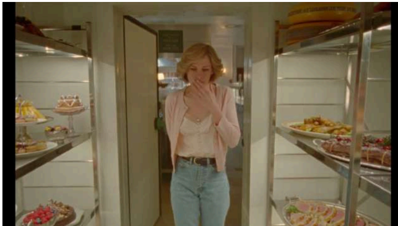
Pict 9 Lady Diana is in the royal kitchen and meets one of the royal guards Duration 38:28 – 39:19

Lady Diana : and what do you watch? New Guard : Mostly in here because of the press, it's a fact that we need to be on guard because of all the silly attention