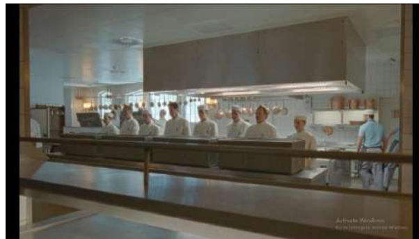
Pict.1 Male dominance in the world of work is depicted through the royal chef Duration 05:09

In this movie, the marginalization of women cannot only be seen and understood through verbal or non-verbal forms of communication and is focused on the main character, Lady Diana. However, restrictions on women in the family, community and access to the world of work can