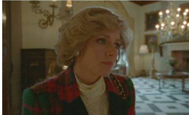
Pict 3. Lady Diana's negotiations with the royal servants Duration 15:47 – 16:14