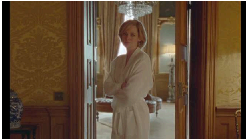
Pict 10. Lady Diana complaining to one of the work officers Duration 48:02 – 50:07

In the picture above it is shown that Lady Diana is wanting to change costumes, only it turns out that the page that usually accompanies her has been replaced, the page change occurred because the old page was very close to Lady Diana. Why is the closeness of Page and Lady Diana considered a problem by the royal family? Because this closeness gives Lady Diana the freedom to determine things that should be regulated by the palace, for example the dress code, the dress code is very strict, this makes Lady Diana even more stressed, but under Gary's supervision, Lady Diana always has the freedom to choose clothes that suit her. he likes it. Lady Diana's action of wearing clothes that did not comply with the dress color rules designated by the palace was an action that wanted to show that the clothes she wore had to match the atmosphere or at least that was what Lady Diana wanted to convey when she wore all black at Christmas mass.